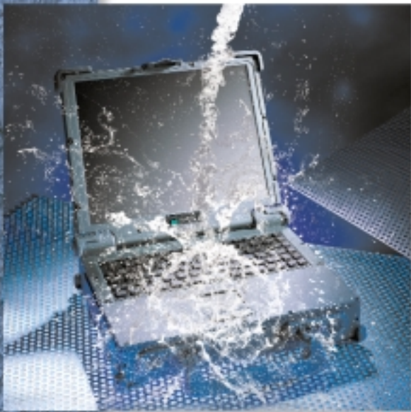
All-Metal Weatherproof Notebook